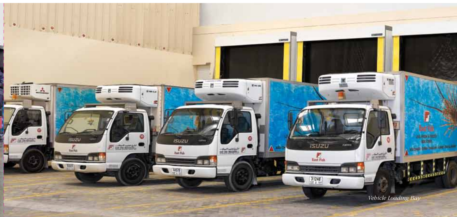
Vehicle Loading Bay