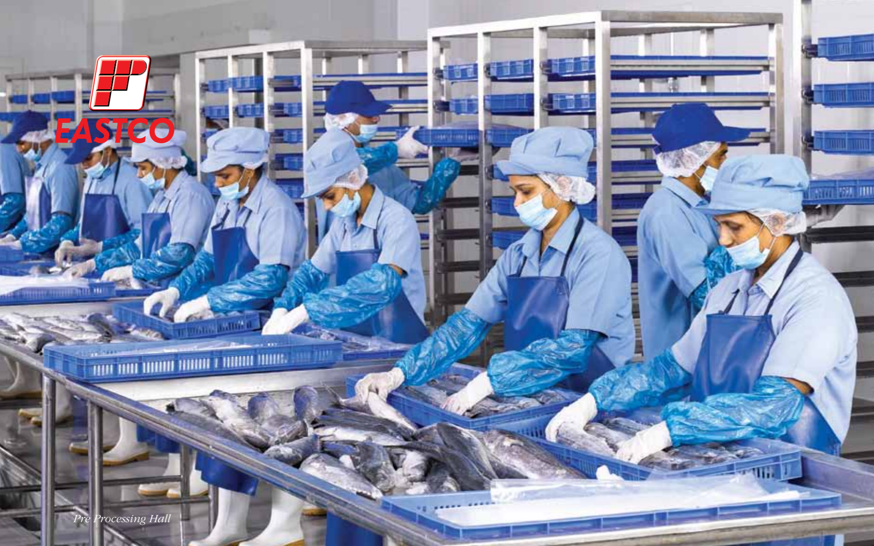
Pre Processing Hall